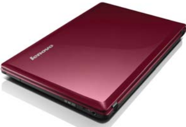
Lenovo G480/G580 Red (Glossy)